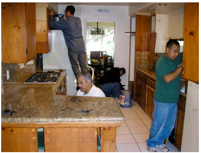
Figure 6-1. Preparing Kitchen for Stripping

A picture of a contractor preparing a kitchen for stripping is shown in Figure 6-1. The stripping formulations used for this type of stripping activity are fairly viscous since they must strip vertical services. The baseline stripper, in this case, was a METH stripper called Lifteeze Paint & Varnish Remover. An MSDS for this stripper is shown in Appendix E. The stripper contains METH, methanol, acetone and toluene. Other strippers containing NMP might also be used for this purpose.