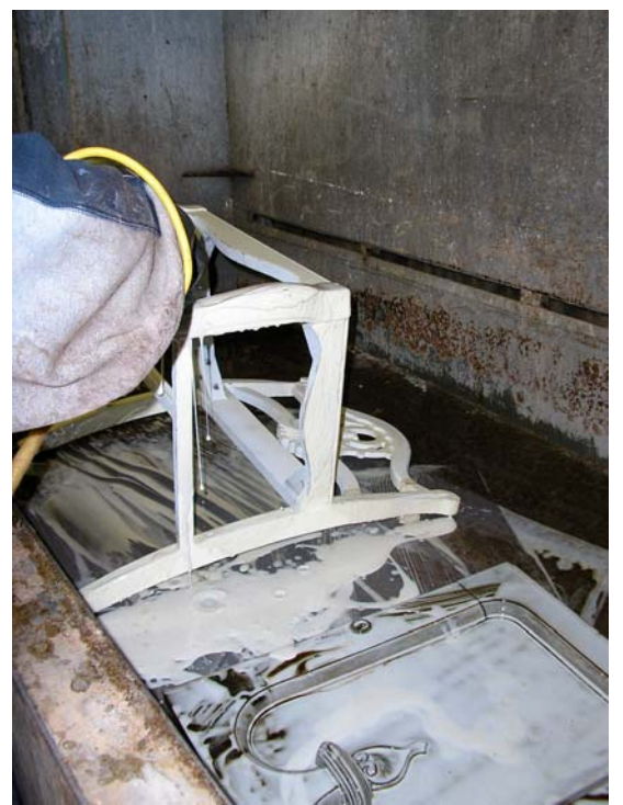
Figure 6-7. Items in Flow Tray at Sunset Strip

A picture of the items in the flow tray at Sunset Strip is shown in Figure 6-7.