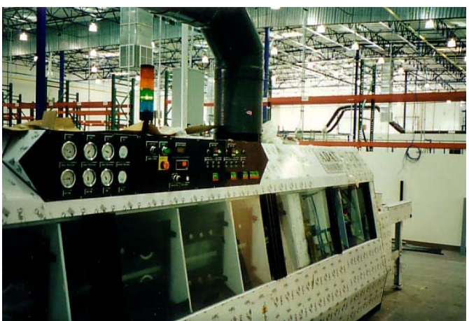
Figure 4-4. Conveyorized Printed Circuit Board Cleaning System

There are several types of flux that can be used to prepare for the soldering operation. First, some companies use low solids flux (sometimes called no-clean flux) that does not require removal with any cleaning agent. Conversion to low solids flux that does not have to be removed is one alternative to using NPB for flux removal. Second, water soluble fluxes are widely available and are used routinely by many companies. This type of flux can be removed with plain deionized (D.I.) water. Third, water-based cleaners called saponifiers can be used to remove traditional rosin based flux. The process involves using a formulated water cleaner and rinsing the boards with D.I. water. In both types of water cleaning, dryers are used to dry the boards after cleaning. A typical water cleaning conveyorized board cleaning system is shown in Figure 4-4.