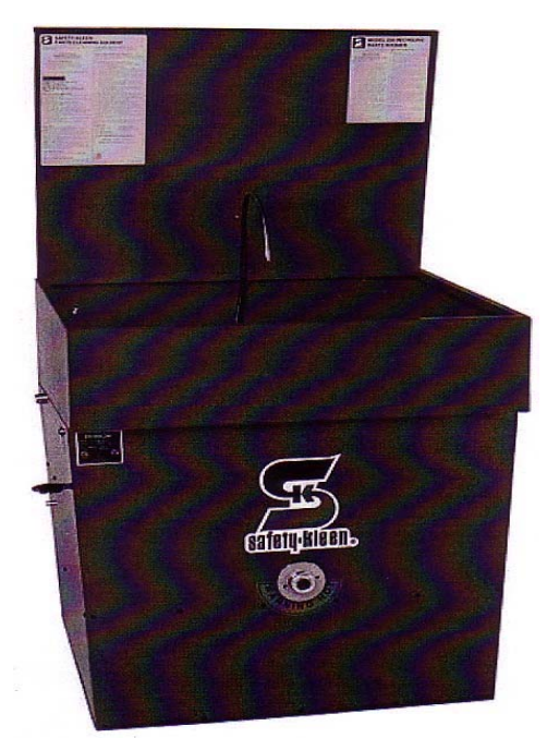
Figure 2-2. D5 Cleaning System