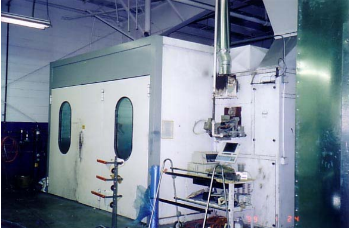
Figure 3-1. Outside of Typical Spray Booth

Refinishing may be done on a spot, a panel or the entire vehicle. Spot repair and paint work is generally performed on a small damaged area. Panel repair is similar except that the work area is larger and may include a hood or a door, for instance. The entire vehicle could be repainted because the paint is faded or a different color is requested. The repair work would generally include the physical repair of the damaged area, conditioning of substrate and application of undercoats and topcoats. Two views of a typical spray booth in an autobody shop are shown in Figure 3-1 and Figure 3-2.