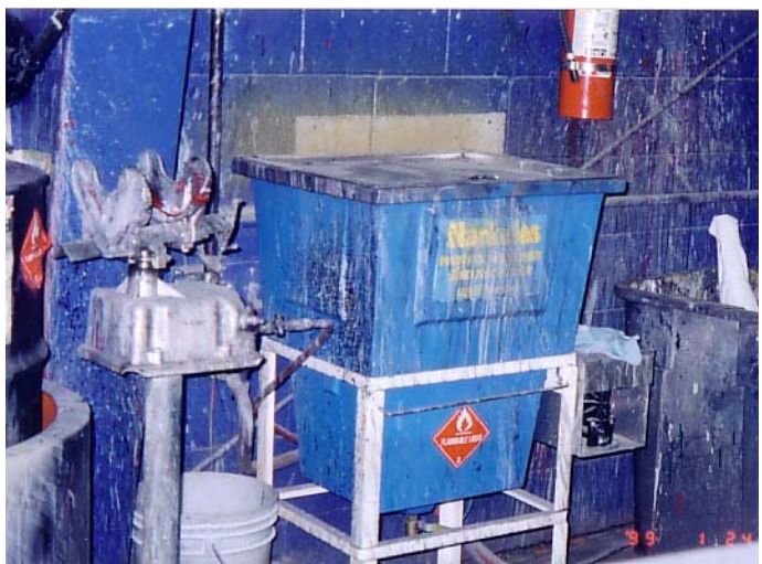
Figure 3-5. Spray Gun Cleaner at Autobody Shop #1

<u>Case Study for Autobody Shop #1.</u> Autobody Shop #1 is located in Santa Monica, California. It is one of a chain of 10 body shops located in Southern California. Like other body shops, the company repairs cars and paints them as part of their process. The company uses High Pressure Low Volume (HVLP) spry guns and the guns are cleaned in an enclosed spray gun cleaning unit leased by Autobody Shop #1. A picture of the gun cleaner is shown in Figure 3-5. A service provider maintains the equipment, supplies the cleaning solvent and disposes of the waste. It is likely that the company was using a solvent containing PCBTF in the cleaning operation.