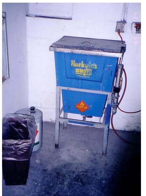
Figure 3-6. Spray Gun Cleaner at Autobody Shop #2

<u>Case Study for Autobody Shop #2.</u> Autobody Shop #2, like Autobody Shop #1, is located in Santa Monica, California. The company repairs cars and, as part of that activity, they paint them. The shop uses an enclosed spray gun cleaner that belongs to the facility to clean the HVLP spray guns that are used to apply the coatings. A picture of this spray gun cleaner is shown in Figure 3-6. The cleaner used by the company is lacquer thinner which would not comply with the VOC limit for cleaners today.