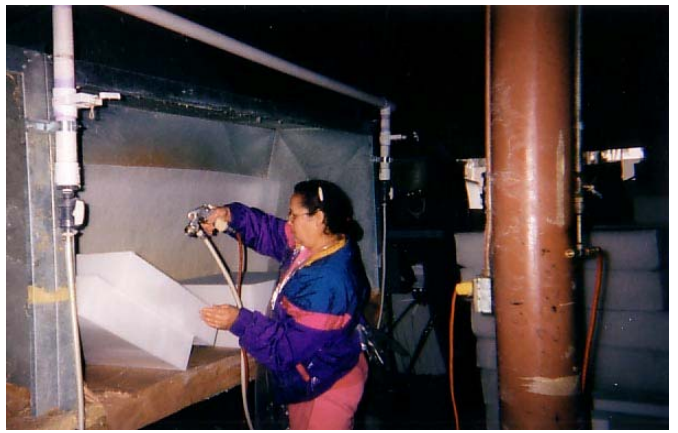
Figure 4-6. Foam Fabrication Operation