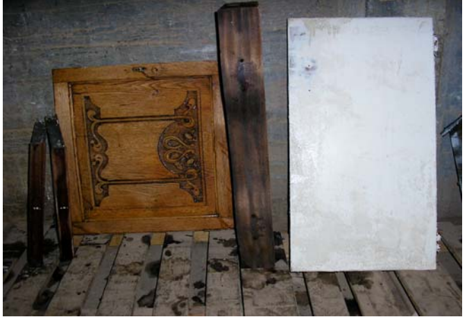
Figure 6-8. Items Before Applying Strippers at Strip Joint

A picture of these items before stripping with #B96 is shown in Figure 6-8.