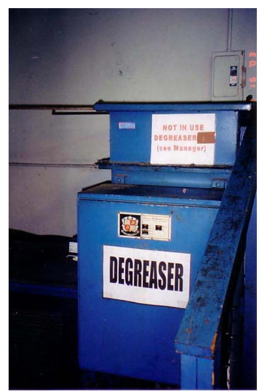
Figure 4-1. Typical Open Top Vapor Degreaser

condenses on the colder part and carries the contaminants into the liquid bath. The vapor zone always contains clean solvent. At times, the parts are cleaned in the liquid solvent as well as in the vapor zone, depending on the cleaning application. When the solvent is too contaminated for further use, the solvent is changed out.