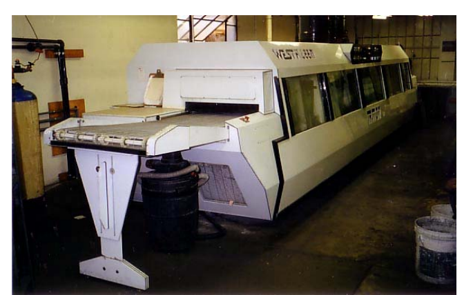
Figure 4-2. Cleaning System at Nameplate Manufacturer

A picture of the water-based cleaning system is shown in Figure 4-2. The capital cost of the system was $128,000. Assuming a five percent cost of capital and a 10 year equipment life, the annualized cost was $13,440.