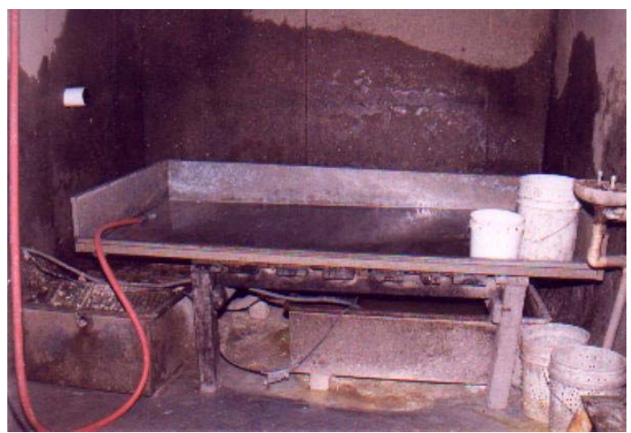
Figure 6-6. Typical Water Wash Booth

When the worker is finished stripping the item, it is transferred from the flow tray to the water wash booth. A picture of a typical water wash booth is shown in Figure 6-6. High pressure wands containing water and oxalic acid are used to rinse the remaining stripper and coating residue from the item. The oxalic acid is used to brighten the wood surface.