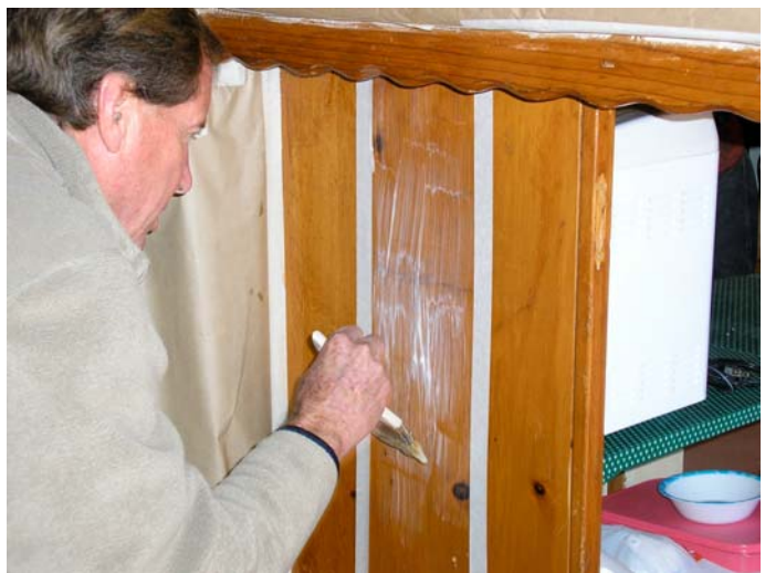
Figure 6-2. Brushing Stripper on Panel

of the panel. Figure 6-2 shows the three strippers being applied to the panel. In a second test, the strippers were applied to a second panel. In a third test, the strippers were applied to a third panel that had coating on top and an adhesive residue on the bottom. The results of the testing indicated that the METH based stripper, Lifteeze, performed better than the two alternative strippers. The contractor judged that the #B95 worked almost as well as the Lifteeze stripper, however, and he said he would be willing to use it. The #B74 alternative stripper did not work as well as the #B95 and the contractor did not like the odor.