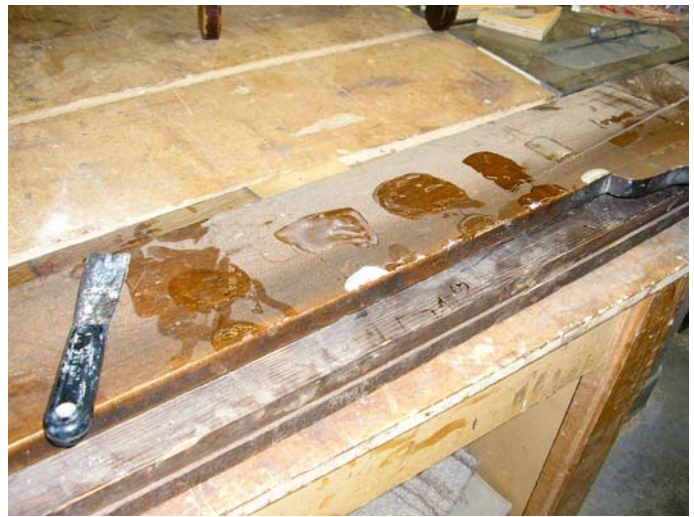
Figure 6-3. Bed Rail After Applying Five Strippers