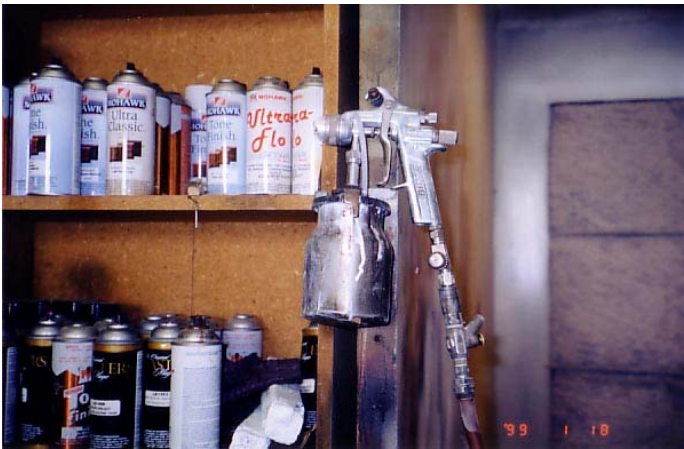
Figure 3-3. Typical Spray Gun

Autobody shops apply their coatings most often with spray equipment. A typical spray gun used in an autobody shop is shown in Figure 3-3. At certain times of the year, when the weather is cold, for instance, the coating does not flow through the equipment as easily. Thinners are used by all autobody shops to thin the coatings so they flow properly during application. Thinners are also referred to as reducers or retarders. Some companies supply slow, medium and fast retarders that are used at different times of the year depending on the weather.