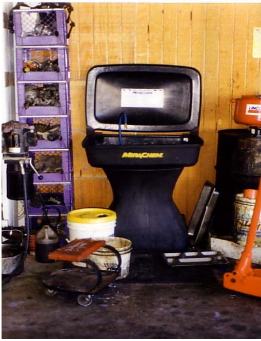
Figure 2-1. Typical Parts Cleaner

this limit was reduced further, to 25 grams per liter VOC. Prior to the regulation, nearly all repair and maintenance cleaning was performed using mineral spirits. After the regulation became effective, nearly all of the repair and maintenance cleaning in the South Coast Basin was performed with water-based cleaners. A typical parts cleaner which is sometimes called a sink-on-a drum that uses a water-based cleaner is shown in Figure 2-1. The water-based cleaner is stored in the drum below the sink and it is pumped into the sink for cleaning. The sink contains a drain and the water-based cleaner flows through the drain to the drum below.