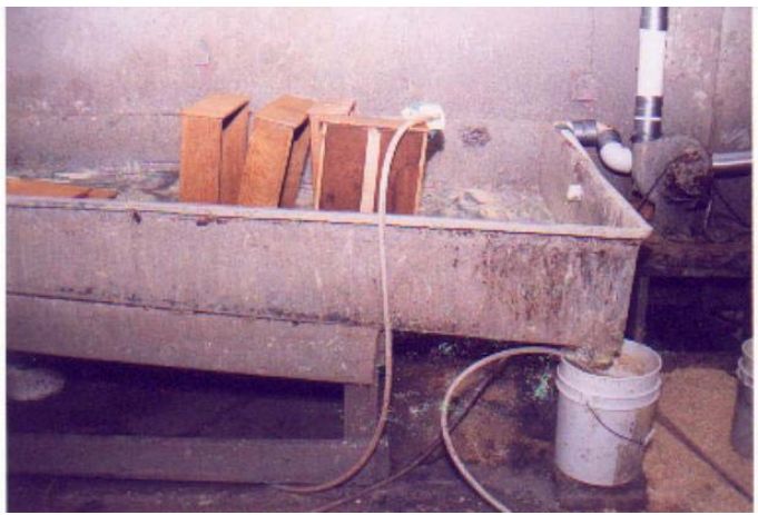
Figure 6-5. Typical Flow Tray

When the worker is finished stripping the item, it is transferred from the flow tray to the water wash booth. A picture of a typical water wash booth is shown in Figure 6-6. High pressure wands containing water and oxalic acid are used to rinse the remaining stripper and coating residue from the item. The oxalic acid is used to brighten the wood surface.