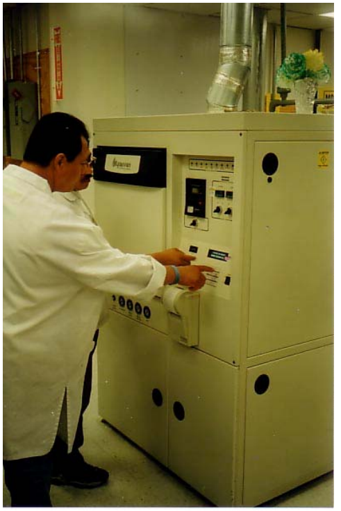
Figure 4-5. Aerospace Subcontractor Cleaning System

In the year prior to the conversion, the cost of the TCA purchased for the printed circuit board operation was $25,000. If NPB were used instead of TCA, the cost of purchasing the NPB would be the same as the cost of purchasing TCA or higher. The cost of the D.I. water used in the second commercial machine was $4.