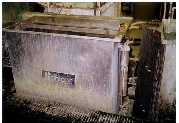
Figure 4-3. Cleaning System at Plating Company

The plating company used a PERC vapor degreaser to clean all of the parts. IRTA began working with the company to identify, test and implement a water-based cleaning system as an alternative to the PERC degreaser. After testing parts containing a buffing compound, a water-based cleaning agent that is effective in removing the compound was selected. The company purchased an ultrasonic water-based cleaning system to clean the parts. A picture of the new ultrasonic system is shown in figure 4-3. The company converted to a water-based process for the parts on the custom line which are cleaned on plating fixtures. The vapor degreaser was still used for the parts on the automated line until the company installed a hoist so the parts from the automated line could be cleaned in baskets in the ultrasonic cleaning system.