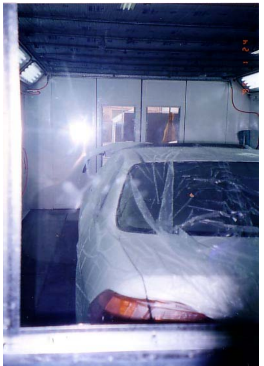
Figure 3-2. Inside of Typical Spray Booth